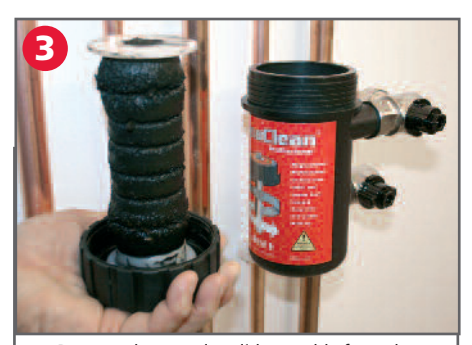
Remove the complete lid assembly from the MagnaClean Professional. Turn the lid assembly upside down in order that the underside of the lid acts as a drip tray.