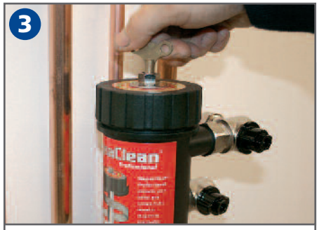
Replace the Pro-Fill air vent. Allow the system to circulate for 30 seconds. Open the Pro-Fill screw two turns and back flush until clear.