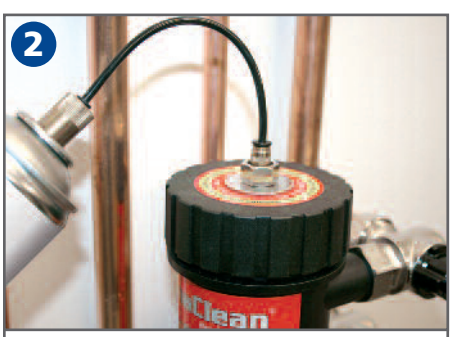
Wait for five seconds before removing the adaptor. The Pro-Fill air vent will accept all market-leading chemicals in either liquid or concentrate form.