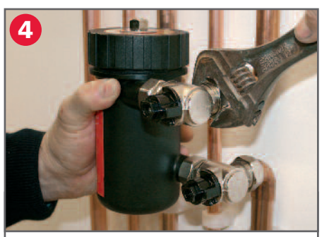
Loosely secure the MagnaClean Professional canister to the valves. Grip the MagnaClean canister and tighten the compression fittings being careful not to over tighten.