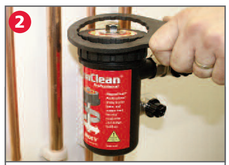
Using the MagnaClean Professional lid spanner, carefully unscrew the lid.