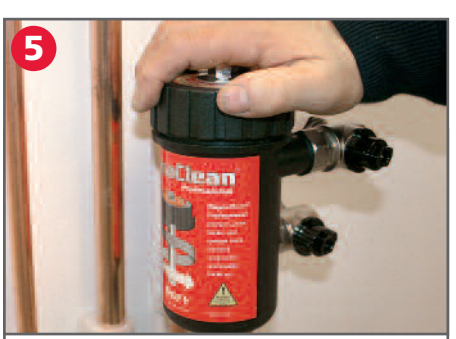
Replace the lid assembly onto the canister and tighten until sealed. Do not over tighten.