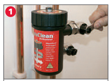
Important – Before commencing any servicing work, turn off electrical supply to the boiler. Ensure the water is not too hot to undertake work on the system. Turn off both isolation valves to the marked OFF position. Loosen the air vent to release internal pressure. When venting, protect the surface below the canister with a dust sheet or container to capture any drops of water.