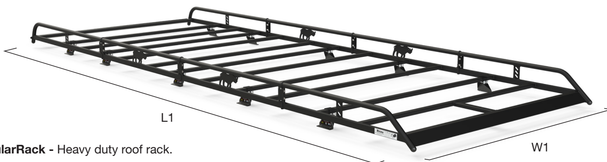
ModularRack - Heavy duty roof rack.

The ModularRack is a van roof storage system that provides quick and easy installation using two, three or four bolted together welded modular sections. Its striking design includes our iconic Rhino emblem. The rack includes an aerofoil that significantly reduces overall wind noise and drag, as well as a full width roller system that aids loading and unloading.