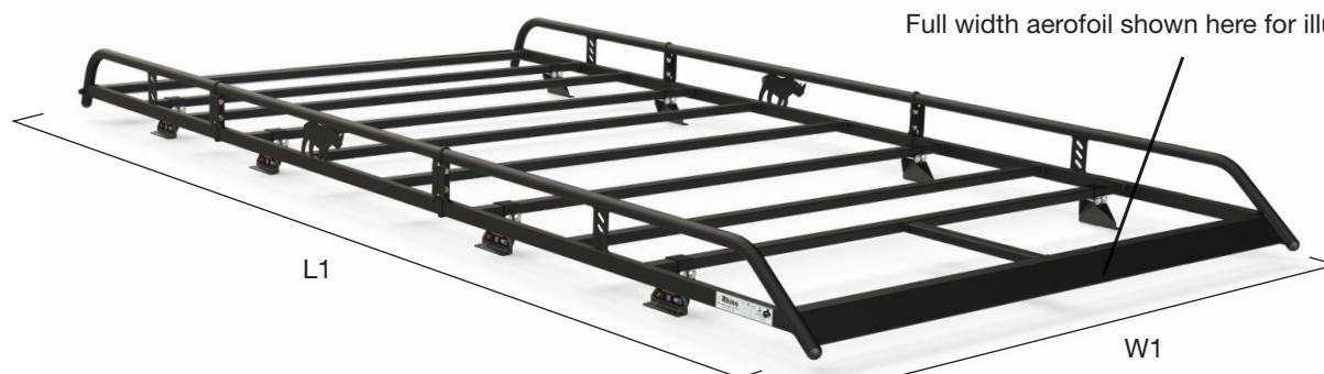
Full width aerofoil shown here for illustrative purposes