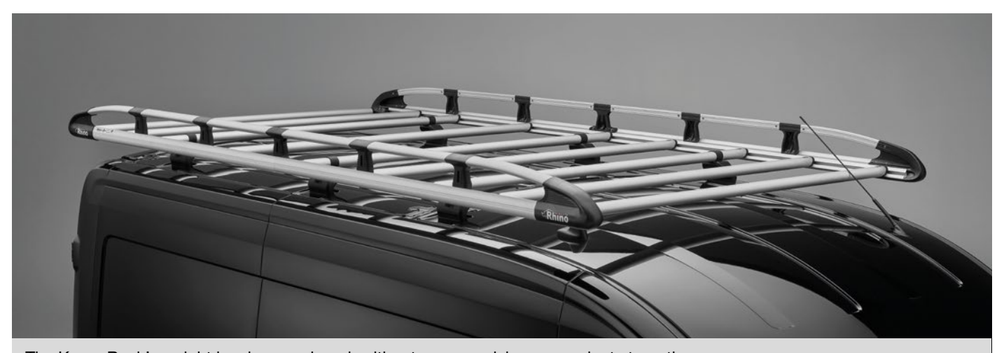
The KammRack's weight has been reduced, without compromising on product strength.